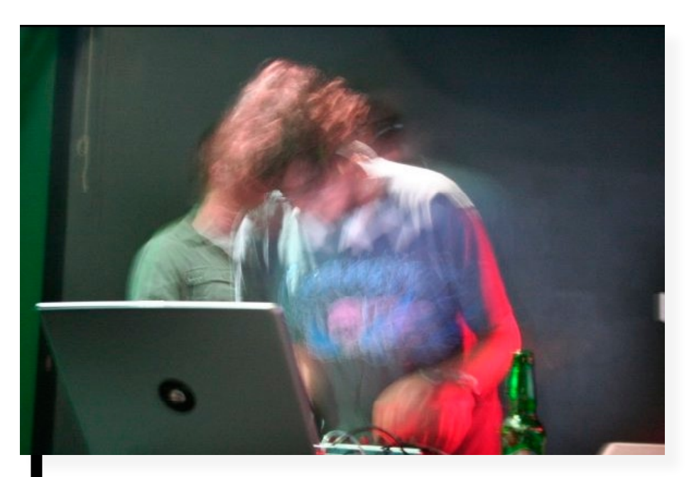
missaw vs abscissa www.englishraveyarea.com

missaw and abscissa are two sides of the same coin, a low-denomination foreign currency that trades in both dancefloor and downtempo markets. As The Centrifuge's compere and resident live remixer, missaw is on hand to supply backup for the live performers. He might be seen with a toy plastic megaphone held high, screaming public disservice announcements. More recently abscissa has reared its beatless head, serving up simple but emotive soundscapes to lose yourself in.